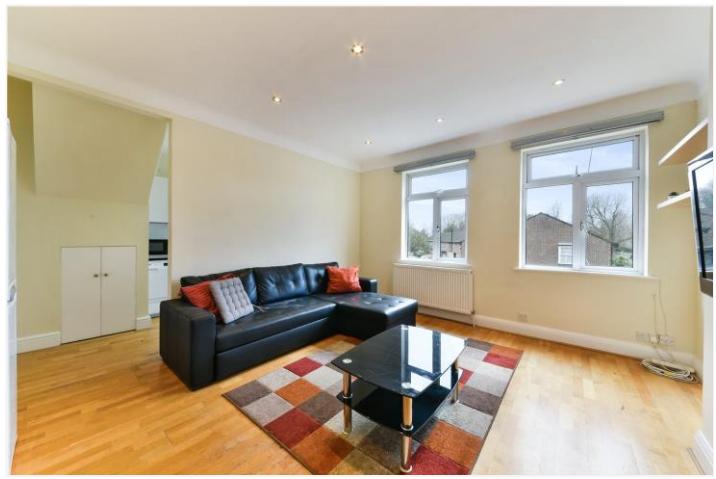
STATION PARADE, W4 £485,000 FREEHOLD