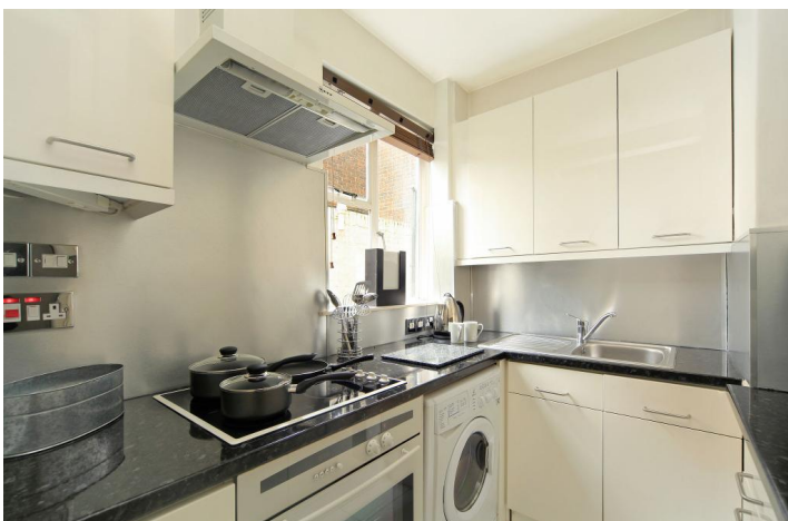
CHEYNE PLACE, CHELSEA, LONDON, SW3 £605,000 LEASEHOLD