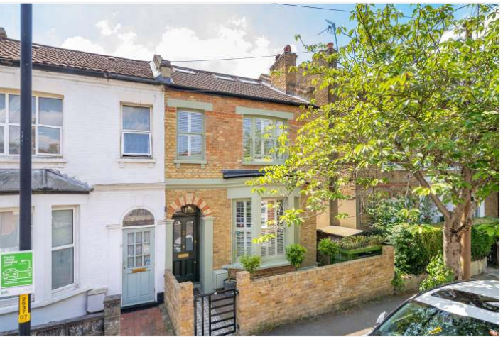
PELLATT ROAD, EAST DULWICH, LONDON, SE22 £1,400,000 FREEHOLD

AN EXCEPTIONAL SEMI-DETACHED FAMILY HOME, SITUATED IN A STELLAR LOCATION CLOSE TO LORDSHIP LANE AND MANY POPULAR SCHOOL CATCHMENTS. Winkworth