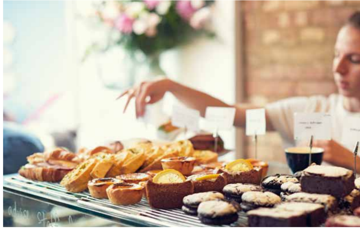
CAFÉ SOCIETY There is plenty of choice, whether you're looking for a bespoke blend or sumptuous cake.