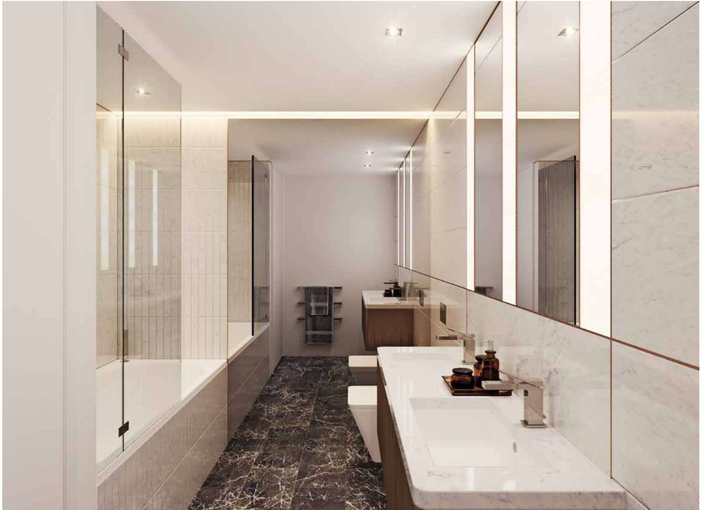
DOWN TO THE DETAILS With clean lines and quality finishes, the bathroom combines modern design with a classic touch.