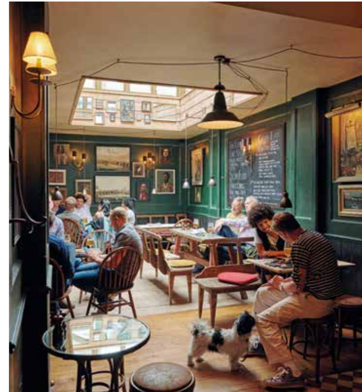
Lore of the Land