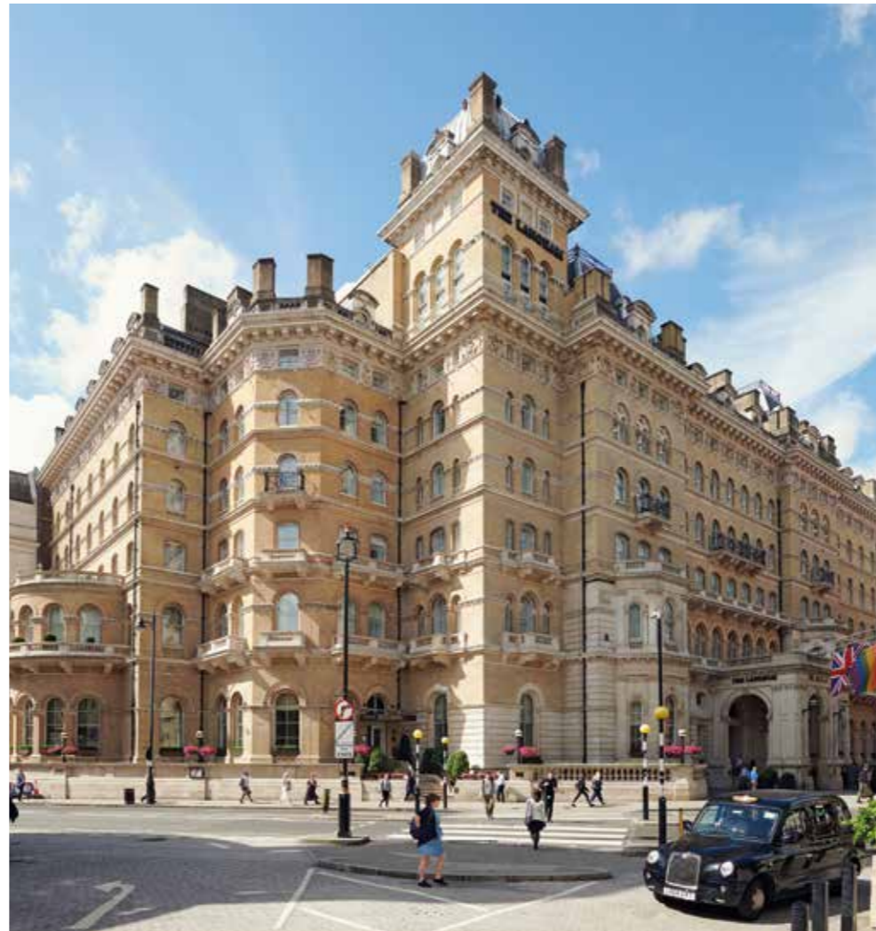
The Langham Hotel