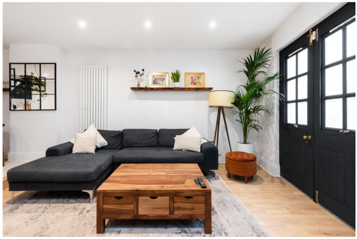
WHELER STREET, LONDON, E1 £1,190,000 LEASEHOLD