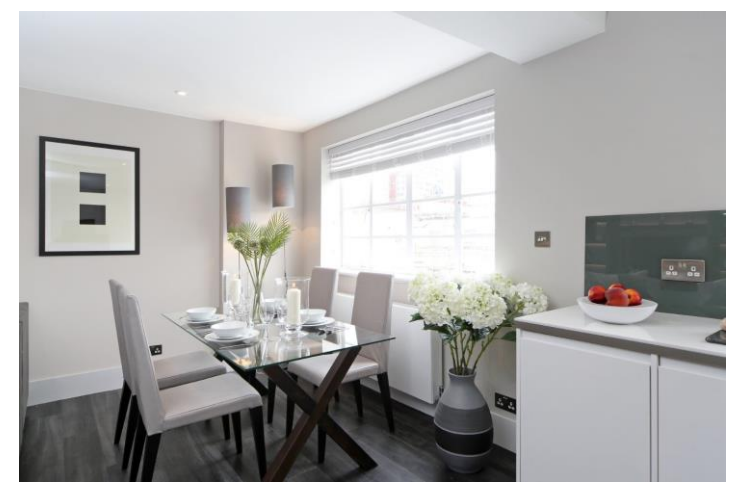
WESTBOURNE CRESCENT, BAYSWATER, W2 £995,000 LEASEHOLD

WITH CLOSE PROXIMITY TO HYDE PARK, SET IN THIS HANDSOME STUCCO FRONTED NON-LISTED PERIOD BUILDING, ON A SOUGHT AFTER BAYSWATER CRESCENT - A BEAUTIFULLY PRESENTED, LIGHT AND WELL-PROPORTIONED TWO BEDROOM, TWO BATHROOM, FOURTH FLOOR (WITH LIFT) APARTMENT.