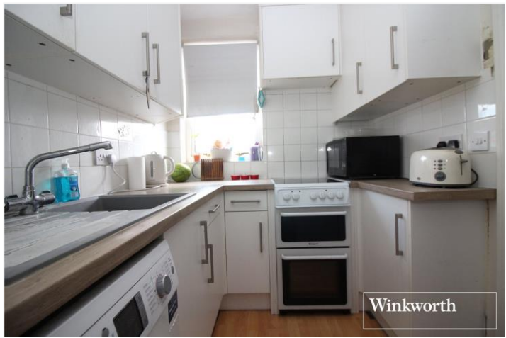
HIGH STREET, BOREHAMWOOD, HERTFORDSHIRE, WD6 £205,000 LEASEHOLD