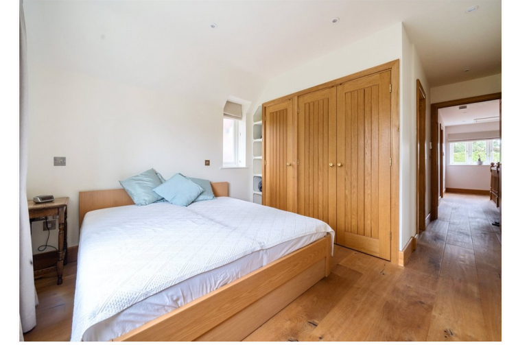
East Bridge Close, Tilford, Surrey, GU10